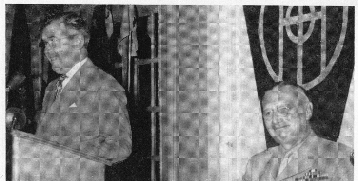
Mayor of Cleveland and Brig. Gen. C. B. Ferenbaugh