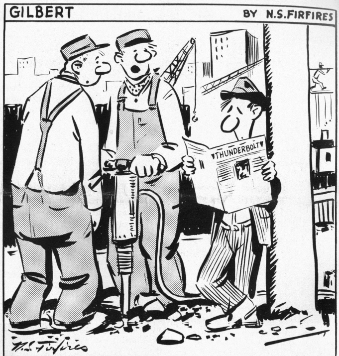
"He always comes down here to read dat paper."

"Thunderbolt" also needs unit correspondents for the 330th, 331st and Special Troops. Volunteers will please inform the Association by letter.