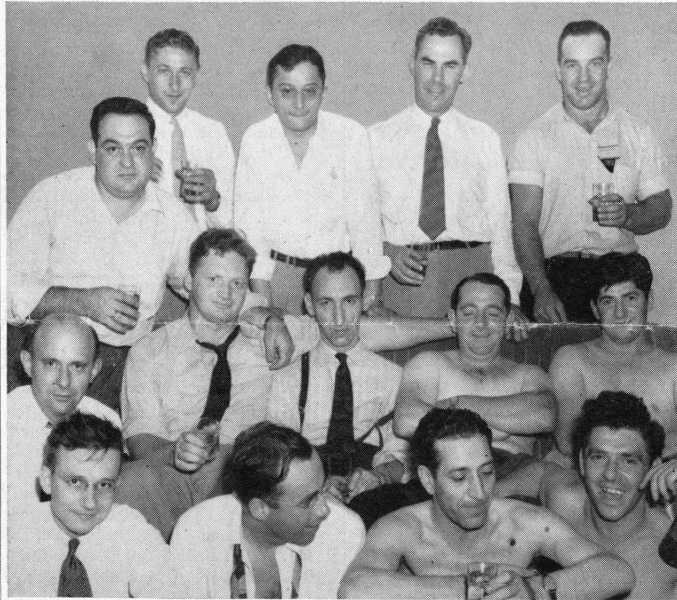
G-2, G-3, and Hq Company men hold out in room 620.