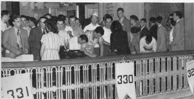
Registration jam at Hotel Carter.